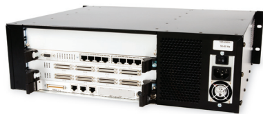
Rear View Multiple network interfaces available

The TANDBERG Media Processing System (MPS) 200 is a reliable, feature rich multipoint control unit, gateway or hybrid. Its flexible, cost-efficient design makes the MPS 200 ideal for small- to medium-sized enterprises requiring centralized or distributed architecture solutions.